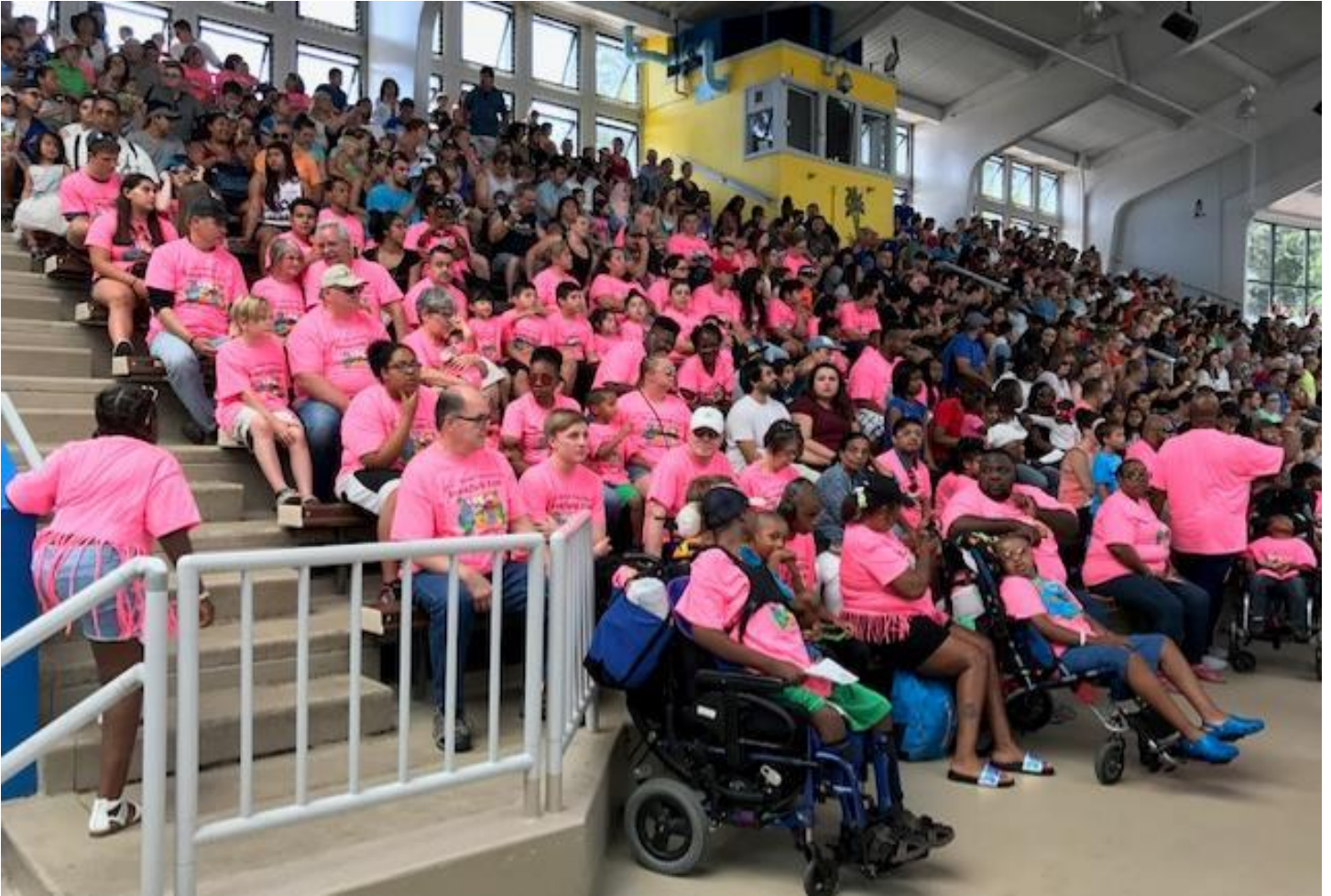
Attending the Dolphin Show