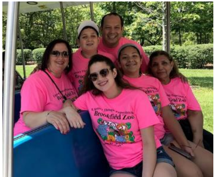
Riding the Tram