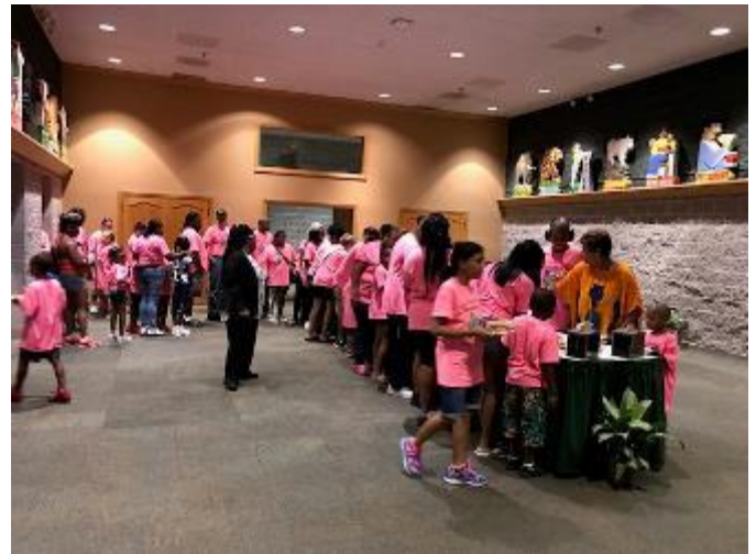
In line for a great pizza lunch